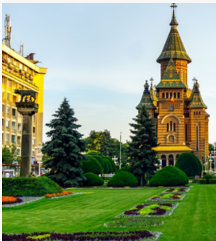
Timisoara Orthodox Metropolitan Cathedral

Is the most important building for the Orthodox Romanians in the Banat - Romania region and one of the most popular destinations in all of Romania.