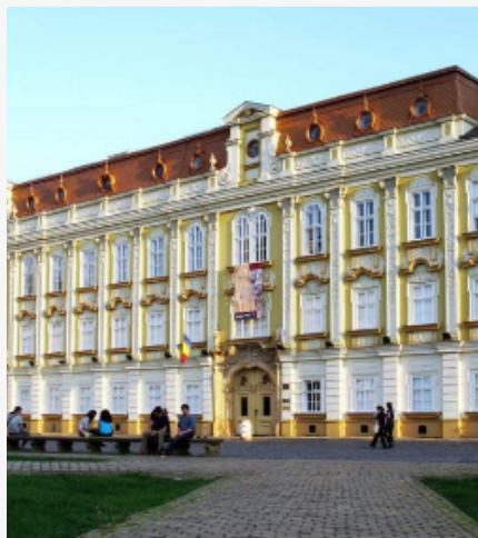
The Timisoara Art Museum

The building, located in Unirii Square, is a historical building that dates back to the 18th century. It was initially designed as an administrative building. It started hosting the Art Museum in 2006.